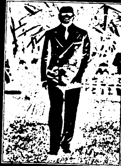
WASHINGTON'S EDGAR HOOVER For his "G-men," a new excuse.

the failure of his tough young men. In the days before they were equipped with sub-machine guns, automatics, tear gas bombs and fast automobiles, he was able to point out that they hadn't a chance against the enemies of society. Now they have these and other armaments and still do not meet with much success,